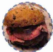
LOBEL'S NEW YORK STEAK SANDWICH