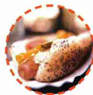
SHAKE SHACK'S SHACK-AGO DOG